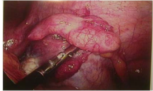
Figure 2: Right Adnexae adhered to anterior abdominal wall.