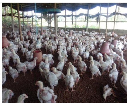
Figure 2: Rearing system of broiler at 24 days.

management practices and economic profitability broiler strain commercial broiler farm at Hathazari Upazilla, Chittagong, Bangladesh.