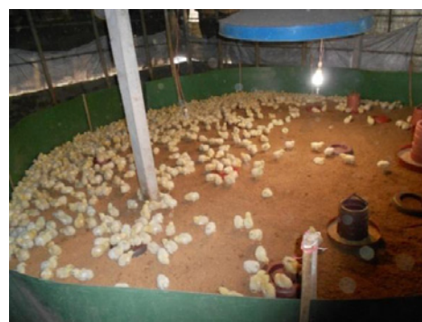
Figure 1: Brooding system of Day-old-chick.

Now-a-days, broiler industry has brought about revolutionary changes and extended tremendously during the last couple of decades across the globe. The body weight gain of the broiler strains has been markedly increased and the feed utilization has been strongly improved with the advancement of new technology applied in