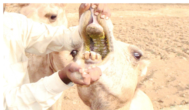
Figures a & b: Moderate to severe dental fluorosis in juvenile (Figure a) and adult camels (Figure b) characterised with light to deep brownish staining on anterior teeth, diffused to well marked spots (central incisors), and irregular wearing. Recession of teeth supporting bone with recession and bulging of gingival tissue is also present [36,39].