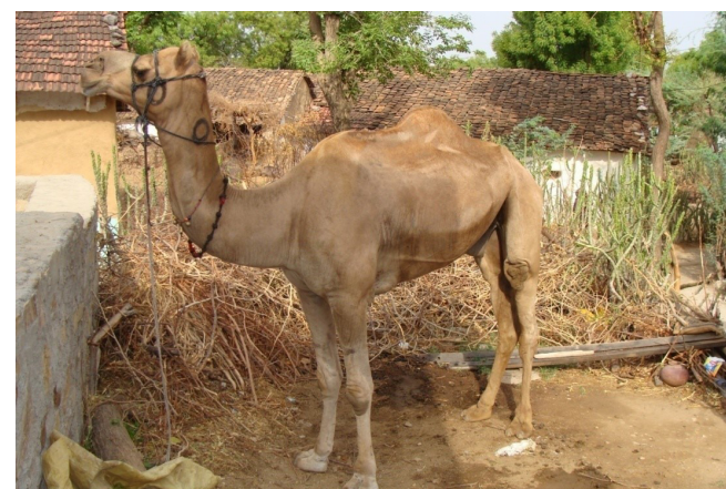
Figure d: Emaciated 11-year-old male camel afflicted with skeletal fluorosis. Note wasted thigh and shoulder muscles and bulging lesions on posterior region of the mandible and lacrimal bones [36].