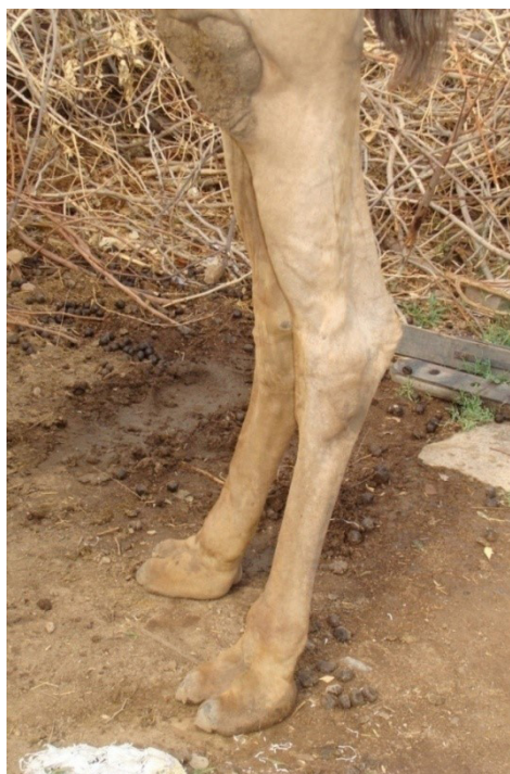
Figure c: Hind legs of 11-year-old male camel (Figure 4) showing diffused to well mark bony lesions (periosteal exostoses) on the femoral, fibular, tarsal, and metatarsal regions. This camel also had dental fluorosis [36].