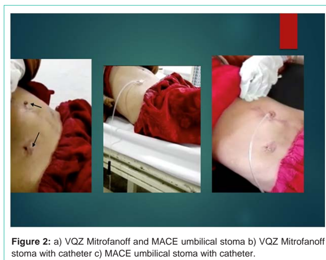
Figure 2: a) VQZ Mitrofanoff and MACE umbilical stoma b) VQZ Mitrofanoff stoma with catheter c) MACE umbilical stoma with catheter.

Post operatively patients were followed at 3 weeks for initiating