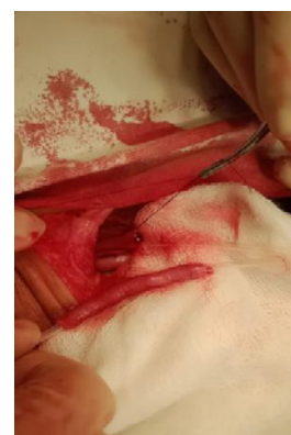
Figure 2: Split (divided) appendix with catheters in both parts for Mitrofanoff and ACE procedures.

leakage from wound and all these cases were managed conservatively with wound dressing and catheterization respectively and late post-op complications of stomal stenosis (one ACE stoma and 3 Mitrofanoff stoma) in 4 (22.2%) patients which required stomal revision.