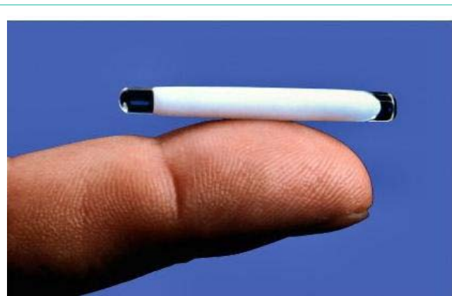
Figure 1: Histrelin implant.

All patients had histologically confirmed adenocarcinoma of the