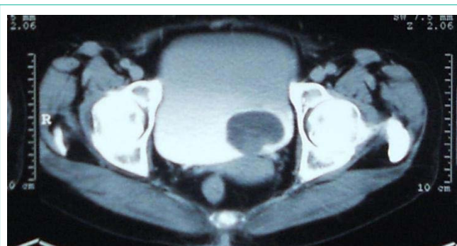
Figure 1: (Case 1) Pedunculated leiomyoma of bladder.

Leiomyomas are the most common non epithelial benign