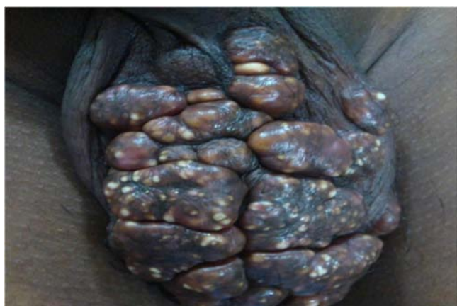
Figure 1: Multiple yellow to skin colored cystic lesions over the scrotum.

A 22-year old unmarried male presented with multiple cystic firm lesions over scrotum. These lesions had gradually grown larger and increased in number over a period of three years. On physical