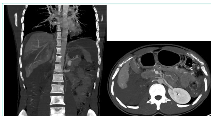
Figure 1: Coronal CT scan showing the right renal artery dissection (red arrow) with a renal devascularization (blue arrow) and the hepatic fracture (yellow arrow).

The body scanner assessment revealed several severe injuries, including a dissection of the right renal artery leading to complete devascularization of the right kidney, a hepatic injury classified as stage 4 according to the ASAAT classification, thrombosis of a right segmental portal bronchus, a right adrenal hematoma, and a substantial intraperitoneal hemorrhage.