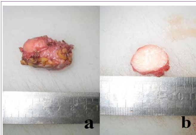
Figure 2: Macroscopic view (a) and cut surface (b) of the resected specimen.