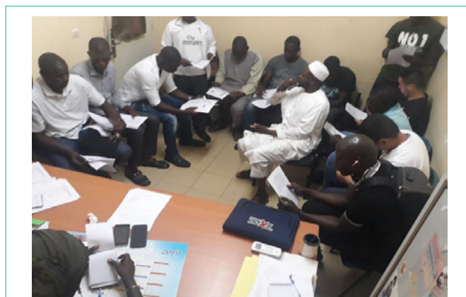
Figure 2: Collective debriefing session with the victims of the Petersen market fire in Dakar (Senegal), Dakar 23/03/2019.

The victims were given therapeutic treatment using the collective debriefing technique. During this activity, the subjects went back over their experiences of the event and explained their needs and expectations in terms of care. Five of the victims, i.e. 31.25% of all subjects, who were very affected with several symptoms of acute post-traumatic stress, benefited from individual psychotherapeutic interviews and remote telephone assistance. Two of these five victims received chemotherapy based on hydroxyzine 25mg for a short period of 15 days (1 tablet in the morning and evening), given the anxiety concerns and physical disorders expressed by the subjects. At the end of the debriefings, the participants, who were victims, thanked us for allowing them to express themselves. One spoke up and said: “I am not used to speaking in front of everyone, especially about these kinds of things, but this was useful”. All the participants welcomed the relief provided by the scheme and asked for more sessions.