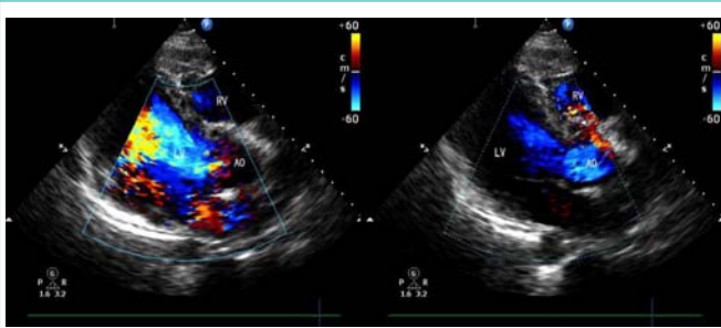
Figure 2: Echocardiography revealed moderate aortic regurgitation and shunt flow from the right sinus of valsalva to RVOT preoperatively.