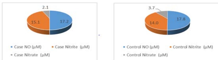
Figure 1: Distribution of Nitrate, nitrite and total Nitrate+Nitrite in the Case and Control groups.