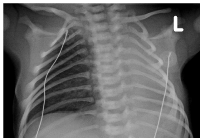
Figure 1: Chest radiograph performed at the age of day 2, mildly rotated to the right side. The left chest is not aerated and the mediastinum is shifted to the left. The left bronchus cannot be identified. Note normal vascularization and aeration of the right lung.

Arterial blood gases were within normal limits. Chest Radiograph (CXR) showed no sign of air or blood vessels in the left chest. A