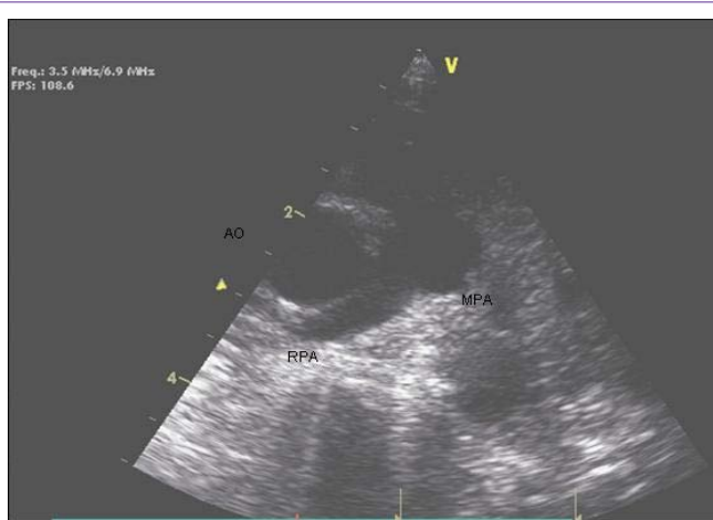
Figure 2: Echocardiogram at the age of 2 days. Parasternal short axis showing Aorta (Ao) MPA (Main pulmonary artery) and RPA (Right Pulmonary Artery) with no evidence to LPA (Left Pulmonary Artery).

leftward mediastinal shift was seen (Figure 1).