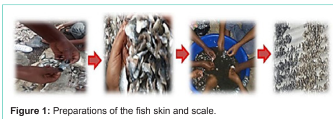
Figure 1: Preparations of the fish skin and scale.

The color intensities (K/S) is used to express the reduction ratio of light owing to absorption and scattering achieved based on reflectance. The higher the color intensities is the more dye is fixed on the fabric and the low dye variation effect will have on the fabric because light is reflected more in a uniform surface. Using color eye 3100 reflectance spectrophotometer result in L x a x b, D-65 and 10° observer the color intensities (K/S) of cationized samples was