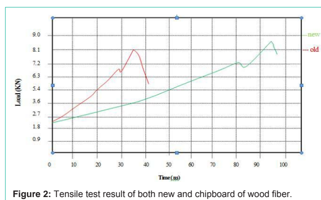
Figure 2: Tensile test result of both new and chipboard of wood fiber.

an adhesive under heat and pressure to form a rigid board with a relatively smooth surface. In this study the same process was taken and the filler material (wood particles) replaced by sugarcane bagasse.