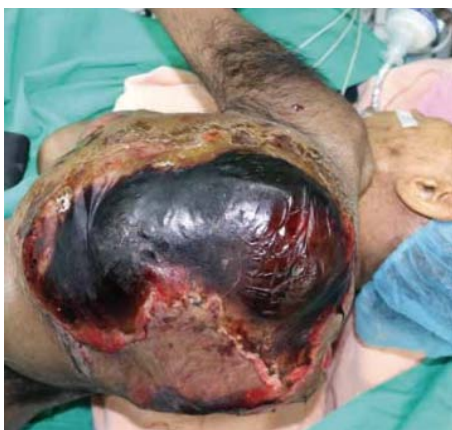
Figure 5: Skin necrosis causing soft tissue infection.

days after admission, severe sepsis due to neurofibroma wound skin necrosis causing soft tissue infection was noted (Figure 5). Clinical condition subsided after systemic antibiotics administration. 11 days after admission, the hematoma and neurofibroma were surgically resected, with 1800 gm hematoma and some active bleeder from