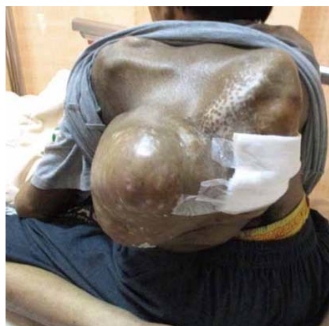
Figure 1: There was a 14x8-cm hematoma originating from neurofibroma on the left side back.