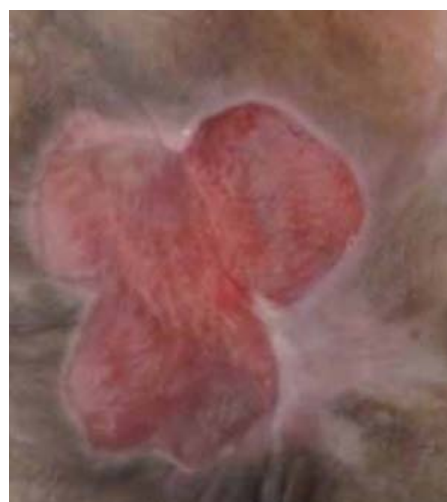
Figure 2: Local tenderness and 5x3 cm skin erosion on neurofibroma were also found.