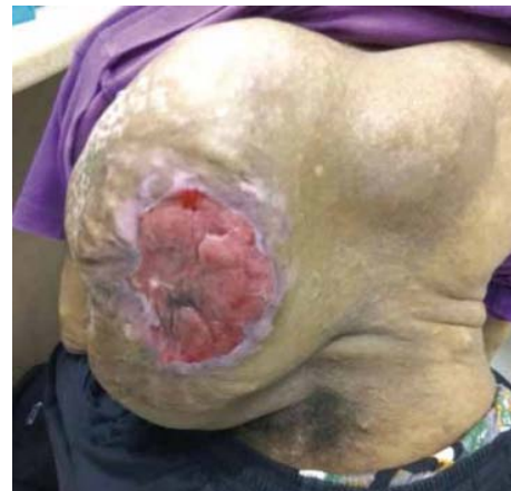
Figure 7: 3-month follow-up.