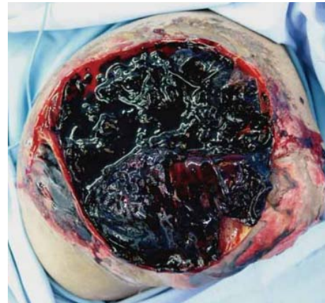
Figure 6: Hematoma and some active bleeder from latissimus dorsi muscle.