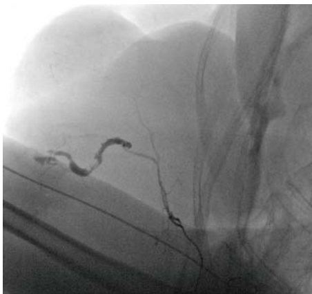
Figure 4: Major feeder was embolized with gel-foam pieces and a 0.018/14cm/4mm coil.