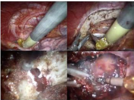
Figure 4: Perioperative images of a FRR. Upper-left corner: initial entry of the thoracic cavity. Upper-right corner: dissection of the parietal pleura exposing the first rib. Lower-left corner: incision of the rib with the surgical drill. Lower-right corner: release of the scalene muscles.

ligament, the anterior and middle scalene muscle and the border of the subclavian muscle are released with a cautery spatula, installed on the right robotic arm (Figure 4).