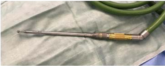
Figure 3: Close-up of the Midas Rex® surgical drill with diamond bur.