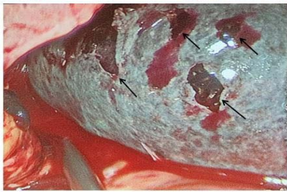
Figure 2: Intra-operative findings: subcapsular hematoma of the upper pole of the spleen (thick arrows); multiple capsular tears (thin arrows).

during bariatric surgical procedures; however it is also a possible but rare post-operative condition [2].