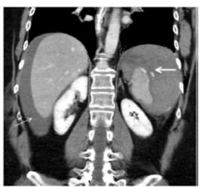
Figure 1: CT scan, portal phase showing intravenous contrast extravasation into peritoneal cavity (thick arrow), and hemoperitoneum (thin arrow).