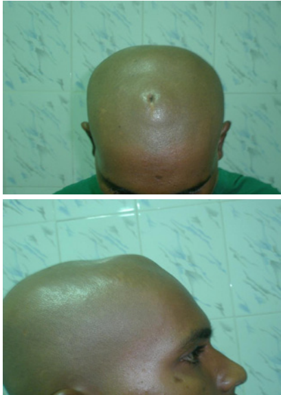
Figure 2: Photograph of another male patient showing the dermoid cyst with punctum.

dermoids [6,7] over the anterior fontanelle with similar conclusions. Reissis and coworkers [8] studied the histology of 16 craniofacial cysts and concluded that histological properties of dermoid cysts are conserved between craniofacial sites (periocular, nasal, scalp, and postauricular). This reflects the consistency of ectodermal inclusion during early embryological development, which is independent of specific craniofacial site or surrounding anatomical structures.