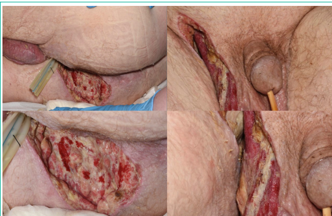
Figure 1: An image of the groin and scrotum on postoperative day 4 after debridement of Fournier's gangrene.

A 61-year-old male patient presented with signs of septic shock to the emergency department. The patient's medical history was significant for type II diabetes mellitus treated with Dapagliflozin and Metformin and hypertension treated with Amlodipine, Atenolol, Lisinopril, Doxazocin and Spironolactone and hypercholesteremia treated with atorvastatin and he was on a lifelong clopidogrel after having a cerebrovascular accident. The patient has been taking dapagliflozin for 11 months and has been diabetic for 10 years. On examination, patient had an abscess in the right groin, hemi-scrotum, and buttock with a wide area of necrotic tissue and foul-smelling discharge.