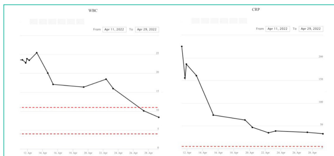
Figure 3: Blood test results over the duration of stay at the hospital showing results for White blood cell count and C-Reactive protein.

stabilization and diabetic control, patient was transferred to a specialized burns unit for further treatment and surgical reconstruction of defects and was discharged 7 days post reconstruction.