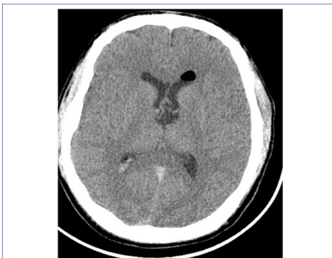
Figure 2: Non-contrast CT scan post-operatively demonstrating no radiographic evidence of colloid cyst.

The patient underwent endoscopic removal of the colloid cyst via an anterior right frontal burr hole assisted by frameless stereotaxy. The surgery was performed with both a zero degree and a thirty degree rigid endoscope. All of the mucoid contents of the cyst were removed, and the majority of the capsule was also removed. A small portion of the capsule was not removed because it was technically difficult to do so without risking injury to the fornix. Pathological analysis confirmed the diagnosis of colloid cyst. No atypical pathological features were noted. Postoperatively, the patient was neurologically intact, and he was discharged from the hospital three days after surgery. A CT scan prior to discharge demonstrated no radiographic evidence of residual colloid cyst (Figure 2). An MRI scan performed six weeks postoperatively was reported by the radiologist to have no