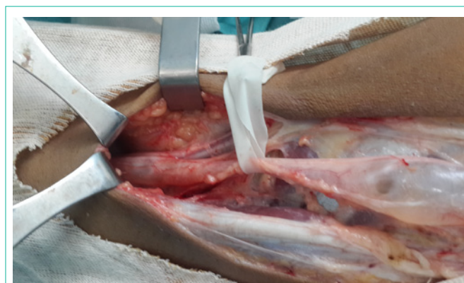
Figure 2: Intraoperative image showing mucinous cyst within the sciatic and common fibular nerve.

We report the case of a 20-year-old man who suffered during a long time from pain and paresthesia in the territory of the common fibular nerve. MRI revealed a presence of a cystic formation, finely septate along the course of the sciatic nerve lower third and common fibular nerve with extension towards the tibio-fibular joint. This formation extends for about 18 cm and is 20 cm thick without enhancement after injection of the contrast and any bone signal abnormality. The cyst was surgically excised through a posterior approach it was within the epineurium and compress adjacent nerve fascicles, we performed ligation of the neck of the cyst preventing further recurrence. The complete nerve decompression results in progressive functional recovery after 6-month follow-up.