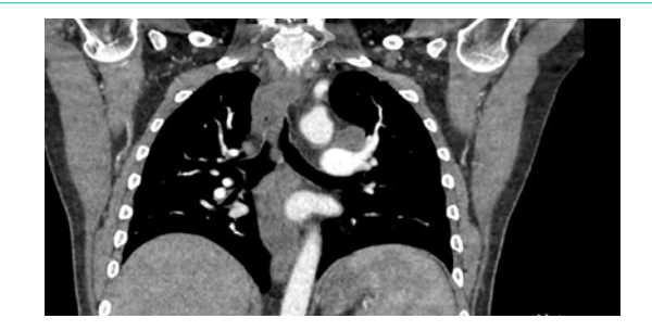
Figure 3: CT scan of chest with IV contrast, coronal section showing enlarged mediastinal LN.

To determine whether the metastatic RCC foci were donor derived (XX) or recipient derived (XY), karyotyping was performed. Analysis identified one normal male diploid cell line and an aneuploid female cell line. The remaining cultured cells were used for a Comparative