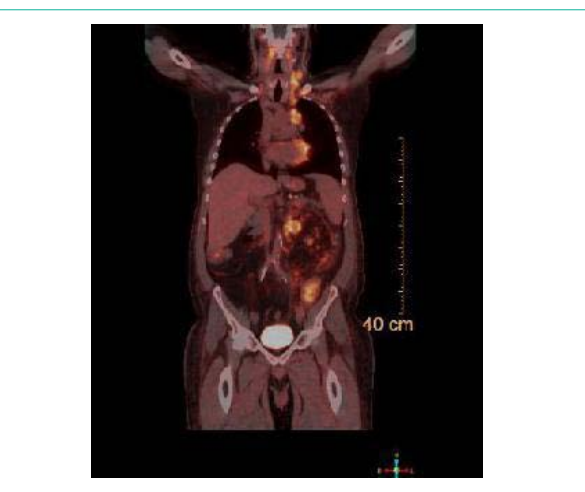
Figure 2: Whole body PET CT showing avid uptake in the left supraclavicular LN, mediastinal LN and para-aortic LN.

core biopsy were pending. It showed PET-avid adenopathy beginning at level of the thyroid cartilage and the left side of the neck extending inferiorly into the mediastinum. There was additional adenopathy in the retrocrural area bilaterally and in the peritoneum left of the aorta. The PET scan results and the patient's clinical picture of weight loss, decreased appetite, and night sweats were suggestive of a high-grade B-cell lymphoma. An excisional supraclavicular lymph node biopsy was performed because of the conflicting findings.