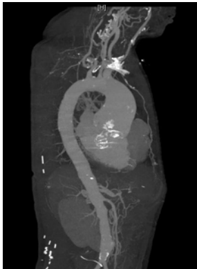
Figure 2: Preoperative CT angiography. CT angiography revealed a 60mm ascending thoracic aortic aneurysm and 66mm dilated aortic root.