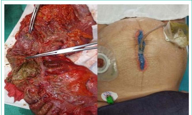
Figure 2: Right hemicolectomy material with 4-5 cm ischemic/perforation area and abdominal wall closure using the Vacuum Assisted Closure (VAC) for evisceration and skin defect.

In this case, conservative management with which corrections of the fluid, electrolyte balance and nasogastric suction were not adequate