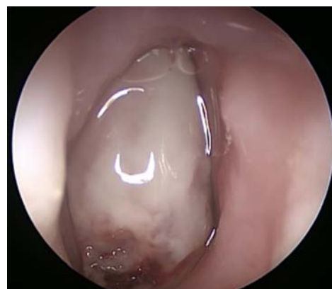
Figure 1: Endoscopic view of right nasal cavity tumor has been demonstrated.

Otherwise healthy three years old male patient was admitted to our tertiary center Otorhinolaryngology department with the complaint of nasal obstruction and hearing loss. Nasal obstruction has increased for three months and sleep apnea was well recognized by his parents for ten days. On his physical examination; there was a solid mass in the right nasal cavity filling also nasopharynx (Figure 1). On otoscopic examination; there was serous otitis media with air-fluid levels in right ear. Maxillofacial and neck magnetic resonance imaging (MRI) revealed a 3x2 cm. solid mass in right nasal cavity