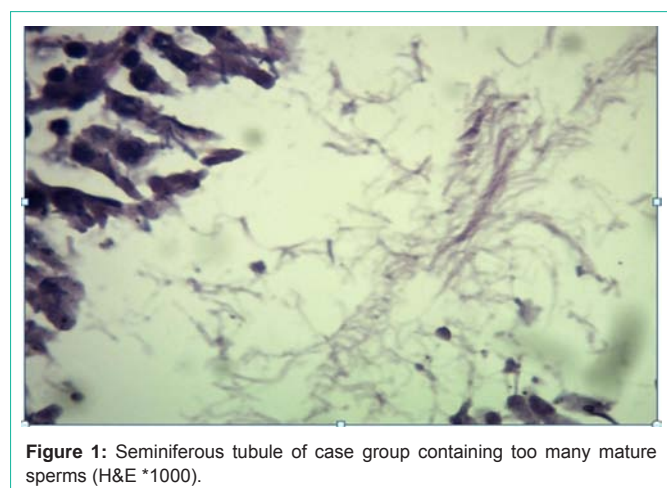
Figure 1: Seminiferous tubule of case group containing too many mature sperms (H&E *1000).