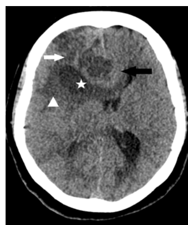
Figure 1: Axial Computed Tomography (CT) image of the head without intravenous contrast show hypodense mass in the right frontal region (white arrow), with a cystic component (asterisk), perifocal oedema (head of arrow) and associated mass effect with subfalcine herniation (black arrow).

Some theories on the pathogenesis of cystic lesions are described