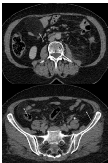
Figure 1: Axial abdominal CT images showing well-circumscribed, non-enhancing masses with homogeneous fatty attenuation corresponding to mesenteric lipomas.

Lipoma is the most frequent benign mesenchymal tumor that resembles normal white fat. Gastrointestinal tract lipomas are rare. The small bowel is the second predilection site of lipomas following the colon. Mesenteric lipomas mainly occur in adults without gender predilection. They are usually asymptomatic and discovered