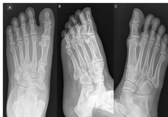
Figure 1: Normal foot radiographs anterior-posterior view (A) and oblique view (B) showing triphalangeal fifth toe. Oblique view of another foot showing biphalangeal fifth toe (C).

Of the 431 cases, 162 were female (37.6%) and 269 were male