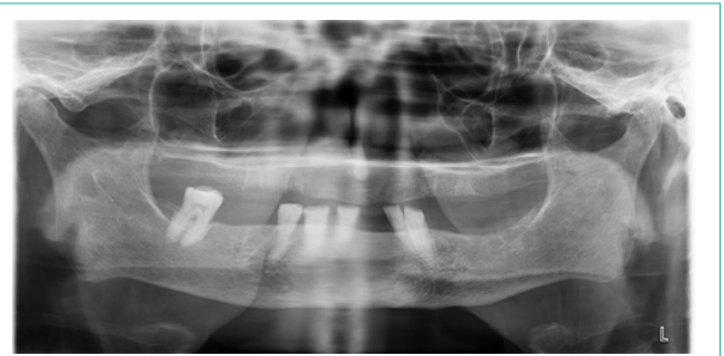
Figure 3: Panoramic image of the patient at 12 months following the procedure.

Several side effects have been reported as related to BPs, particularly in the jaws, since increased osteoblastic and osteoclastic activities occur in this region [15]. This increase in activity may cause