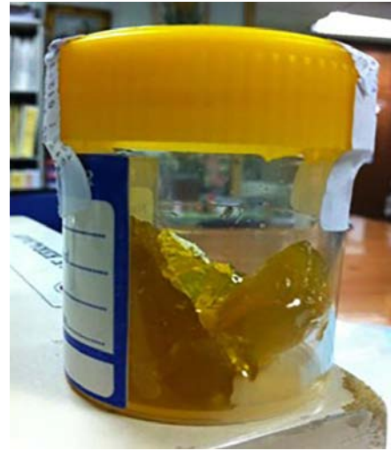
Figure 3: Seventeen-month-old girl with crystal jelly ball ingestion (Case 2). Specimen of a polymer crystal jelly ball bezoar obtained post-operatively after removal following enterostomy.

The most common ingested FB in children is organic with approximately more than half of the cases are peanut [2]. Organic materials are radiolucent on radiograph and this is also true in decorative crystal jelly balls. Radiograph will only show the complications of intestinal obstruction which is similar as in our cases [4]. On the other hand, radiopaque FB such as coins, batteries, sharp or metal objects, magnets, bone particles and fruit stones were demonstrated in 26.55% of cases [1,3].