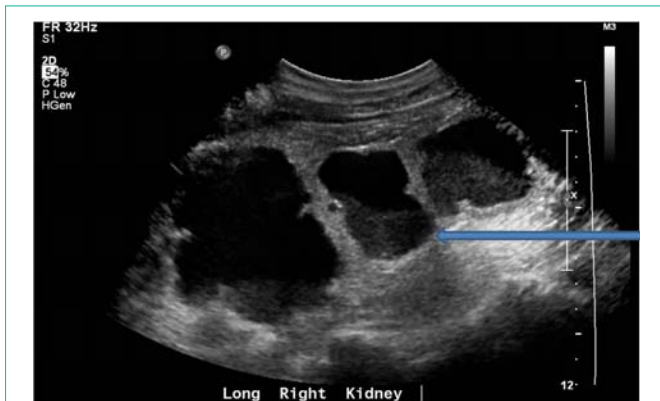
Figure 2: Ultrasound of the patient in Figure 1 shows dilated renal calyces with layering debris. Percutaneous aspiration revealed frank pus.

The urinalysis was positive in 26 out of 27 cases (96%). Only one patient with Pyonephrosis had a negative urinalysis, and the culture obtained from urinary aspiration was positive for Candida . The white blood cell count was abnormally elevated in 18 out of 29 cases (62%), and bacteremia was present in 13 out of 28 patients (46%). Neutropenia was present in one patient. Of note, no patient with Pyonephrosis had a triple-negative clinical finding (normal white cell count, normal urinalysis and no bacteremia). Both bacteremia and leukocytosis were present in the patient with Pyonephrosis and a normal urinalysis.