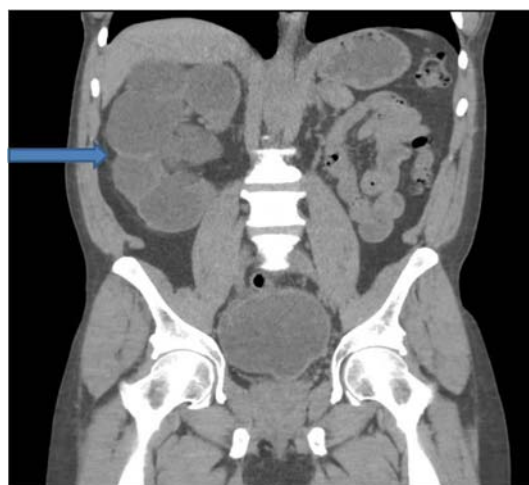
Figure 1: Figure 1 is a coronal CT scan of the abdomen and pelvis showing severe hydronephrosis with renal cortical thinning in a patient with right flank pain and fever.

A preprocedural urinalysis was obtained in 27 out of 30 patients.