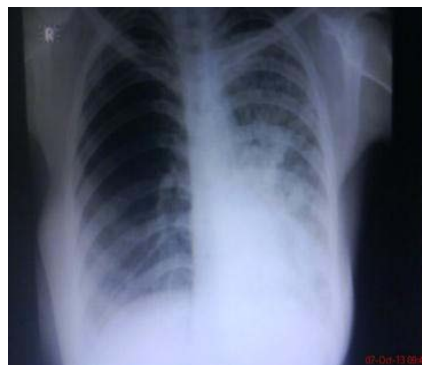
Figure 4: CXR day after FOB.