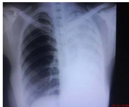
Figure 1: CXR PAV (at presentation).

The forceps were passed through bronchoscope and punch biopsies were taken. The granulation tissue was cautiously nibbled with the forceps. After some digging into the tissue a pinhole opening could be created. Balloon catheter was passed through this small opening and balloon was inflated multiple times. After several attempts of balloon dilatation the lumen could be widened a little. However, bronchoscope could not be negotiated across this hole. Lot of pus-like material was aspirated from left lung. At this point of time, option of placing a stent was discussed with family if suggested by repeat skiagrams.