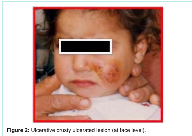
Figure 2: Ulcerative crusty ulcerated lesion (at face level).

61% of cases, confirming an active indigenous transmission in this outbreak. Ages (10-15) and (15-45) are equal (Figure 1). Women and children consult more frequently than men.