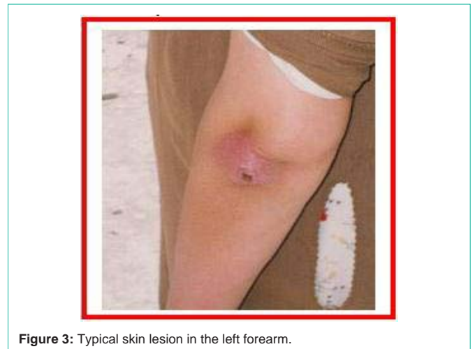
Figure 3: Typical skin lesion in the left forearm.

The non-immunized population influx arriving in natural foci of transmission, changes in the ecology of vectors and host reservoir