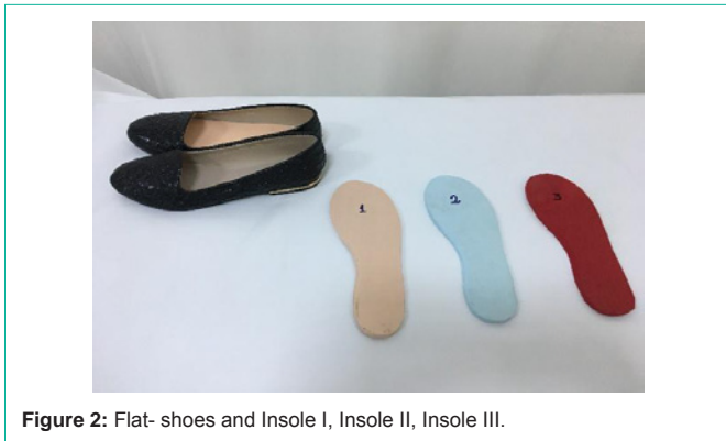
Figure 2: Flat-shoes and Insole I, Insole II, Insole III.

Ethylene-vinyl acetate (EVA) is a highly elastic copolymer with ethylene and vinyl acetate sintered to form a porous material similar to rubber but with excellent toughness. The porous elastomeric characteristic of EVA is much more flexible than that of low-density polyethylene, which is commonly used in shoe construction; due to its resistance, flexibility, and temperature toughness properties, EVA is among the most used copolymers in shoe midsole construction. The addition of EVA to elastomers could lead to the ideal softness and high resilience characteristics needed for a full-recovery capacity in the next foot step after a heel strike, while a less resilient (more viscous) material could attenuate more energy during the initial loading cycles, easily achieving compression flattening after some cycles [8,9].