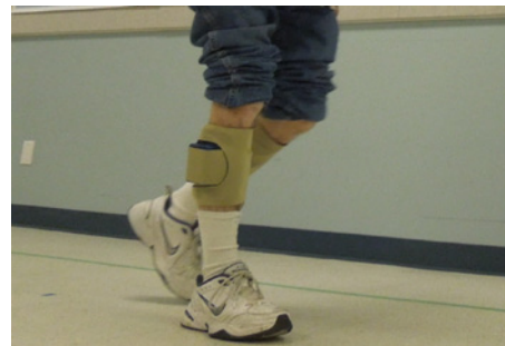
Figure 1a: A prototype FES system designed to activate the dorsiflexors and plantarflexors bilaterally while walking.

Baseline (T0), post-treatment (T1) and follow up (T2) measures were collected according to the protocol from the original study [17]. The crossover data (T3) documented outcome measures for the nine patients enrolled in the crossover phase. Five measures included: 1) Walking distance was determined by measuring meters traveled during the 6MW test [18]. If patients were unable to walk the full six minutes, they were allowed to sit and rest until they were ready to continue. 2) The PPI was used to determine the severity of ischemic walking pain. After the 6MW, investigators asked patients to rate their ischemic pain in their lower legs by placing a hatch mark on a 0-100mm horizontal line. Patients were instructed that 0 meant "no pain" and 100 meant "the most intense pain ever experienced." 3) Changes in lifestyle were measured using Factor 3 (Symptoms and Limitations in Physical Functioning) of the Peripheral Arterial Disease