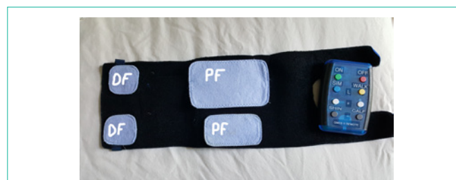
Figure 1b: Water based microfiber electrodes cuff and a wireless remote control.

time point are summarized in Table 1. T0, T1, and T2 represent the testing time points when participants were in the control (walk only) group of the original study and T3 represent the testing time point following 8 weeks of walking with the FES. At study completion, the group’s mean IC measured by the PPI was reduced by 81.7%, the distance walked in 6min increased by 5.5%, factor 3 of the PADQOL increased by 63.2% and the ICQ by 26.1%. Performance on the TUG remained unchanged after 8 weeks of walking with the FES.