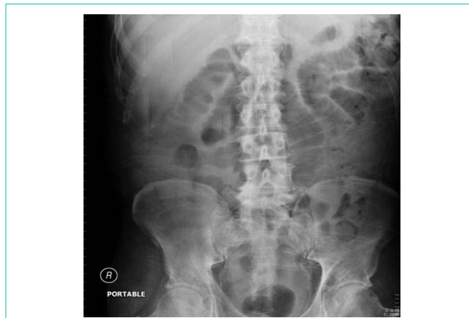
Figure 1: Portable AP x-ray view of the abdomen.

The object was a plastic buckle from a hand mitten presumably ingested during his acute hospitalization. The buckle lodged itself around the bumper, causing increased resistance and difficulty in the removal of the PEG. When the PEG broke, the bumper and buckle were released causing the small bowel obstruction that was managed medically.