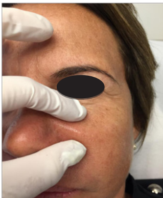
Figure 2: Palpation of the inflammatory nodules in the malar region.