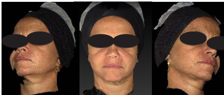
Figure 4: The patient before treatment, in the photos above, The patient after the treatment, in the photos below. In the first photos, showing inflammatory nodules in the malar region and nasogenian sulcus. In the latest photos, there's an improvement of the lesions, but the non inflammatory nodules in the nasolabial sulcus are still present.

procedure with hyaluronic acid. In this case, the hypothesis of systemic infection was excluded after the clinical history and the laboratory research. The new procedure with the use of hyaluronic acid may have served as a trigger for the development of this systemic reaction, as already mentioned in the literature.