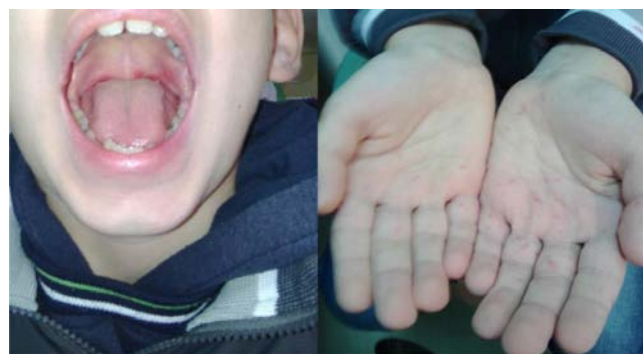
Figure 4: Vesicular lesions of the soft palate and papular rash on the palms in a 9-year-old boy.

Case 4: (nine year-old-boy). In early October 2014, in a boy's palms appeared a rash and he had a sore throat. Although he was in a good general condition, on the soft palate were present vesicular lesions (vesicular lesions were presented on the soft palate), and papular rash was on the palms (Figure 4). The disease was fully withdrawn, without any specific therapy.