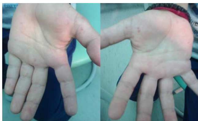
Figure 1: Macular rash on the palms and soles in a 5-year-old boy.