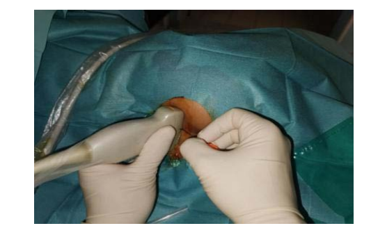
Figure 1: Transverse placement of the ultrasound.

We report a case of a six years and half-old child with JS, scheduled for cure of bilateral testicular ectopy and circumcision. The bodyweight was 16 kg. The patient had hypotonia, and mental retardation. The anaesthesia assessment did not found any other abnormality. The chest X-ray showed normal lung parenchyma appearance with a normal cardiothoracic ratio and the laboratory analyses were within