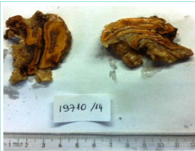
Figure 1: Diffuse hyperplasia of the right and left adrenal glands (macroscopic view).

hypertrichosis. Her pubic hair and breast development were stage 4 and stage 3 respectively, according to Tanner staging. No stretch marks were noticed. Physical examination of all other systems was normal. Laboratory measurements revealed mildly elevated morning cortisol levels (25.92 µg/dL, Reference range [RR]:3-10) with normal fasting glucose (71 mg/dl, RR:74-110) and insulin (13.53 µU/mL, RR: 0-17) and elevated serum lipids (Total Cholesterol: 267 mg/dL, RR: 0-200, Low Density Lipoprotein-Cholesterol: 167 mg/dL, RR: 0-130, High Density Lipoprotein: 66 mg/dL, RR: >40 and Triglyceride: 169 mg/dL, RR: 0-150). Other laboratory findings were within normal limits. The patient was further evaluated for hypercortisolism and hormonal investigation revealed loss of circadian rhythm (plasma morning cortisol 42.17 µg/dL (RR:3-10), midnight cortisol 16.44 µg/dL (RR: <7.5) and morning ACTH 6.74 pg/ml (RR: 2-49), midnight ACTH: 7.97 pg/ml (RR 5-10, normally lower than morning level) and elevated Urinary Free Cortisol (UFC) level (573.3 mg/day [398 µg/m 2 /day], RR: 10-100 µg/day). Overnight Dexamethasone (DXM) test showed no suppression (plasma cortisol after 1 mg DXM 24.96 µg/dL, RR: <1.8). Low dose DXM suppression test (0.5 mg every 6 hours for 8 doses) showed no suppression of cortisol levels (plasma cortisol 10.52 µg/dL, RR: <1.8, UFC 110 µg/day [76.38 µg/m 2 /day], normally < 10% of baseline, ACTH: <1.0 pg/ml after test).