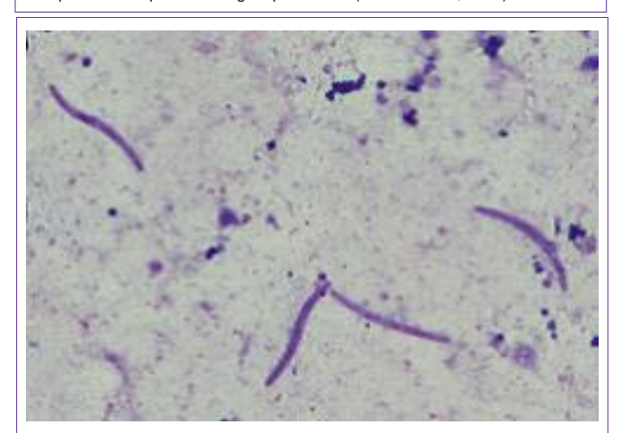
Figure 2: Photomicrograph of teased out contents of salivary gland of female Anopheles mosquito showing 4 sporozoites (Giemsa stain, 1000x).