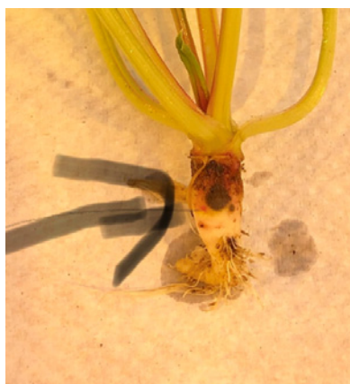
Figure 4: Symptoms on sugar beet roots inoculated artificially with A. alternata .

for Ion Torrent™ for sequencing in Ion Torrent™ Personal Genome Machine™ System. The sequencing data were BlastX searched against an updated NCBI non-redundant database utilizing the high-throughput alignment program DIAMOND. A microbiome analysis tool MEGAN Community Edition v6.12.3 was then used to assess the blastX results and this confirmed to be A. alternata