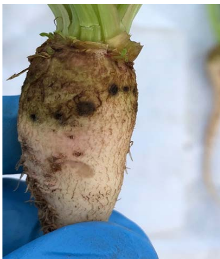
Figure 1: Infected sugar beet root collected from the field in Arizona.

Sugar beet ( Beta vulgaris , L) is an economically important crop which is contributing 55% of the total sugar in the USA. In April 2018, irregular dark brown symptoms were observed in sugar beet stecklings in Arizona where different sugar beet cultivars were grown for seed production (Figure 1). The symptoms covered approximately 5% on the sugar beet root surface. Symptomatic beet root tissue were excised from the junction of diseased and healthy tissue. Small pieces (5mm 2 ) were surface sterilized with 10% sodium hypochlorite for 1min, rinsed thrice with sterile distilled water, air dried and transferred to clarified V8 (CV8), and Potato Dextrose Agar (PDA), and incubated at 24°C with a 12h photoperiod for 5 days. White-dark green velvety colony appeared on both media (Figure 2). Isolates were developed by the single spore isolation technique. Conidia were obclavate or ovoid, two to four transverse septa, and pale brown, often in chains (4 to 8 conidia) and or solitary (Figure 3). The dimension of conidia varied from 20.21-40.15 x 7.50-14.12 μm [1-3]. Based on the morphological characters, the fungus was tentatively identified as Alternaria species. Genomic DNA were extracted via Qiagen kit. A total of 40ng genomic DNA was used to generate a library using NEBNext ® Fast DNA Fragmentation & Library Prep Set