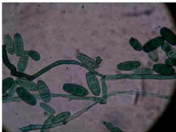
Figure 5: B. Specifera microscopy showing Macroconidia.

study from Iran [13] all patients with acute invasive form of sinusitis had an underlying disease, diabetes (71.4 %) or malignancy (28.6%).