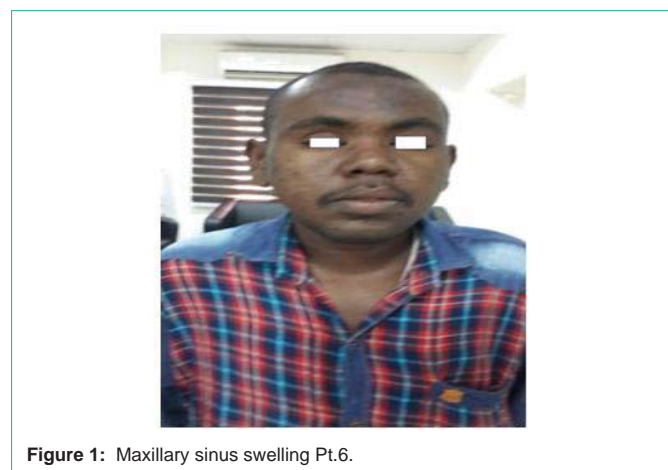
Figure 1: Maxillary sinus swelling Pt.6.