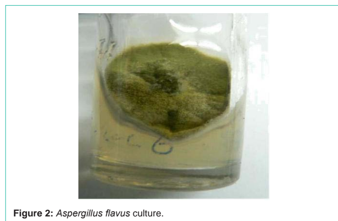
Figure 2: Aspergillus flavus culture.