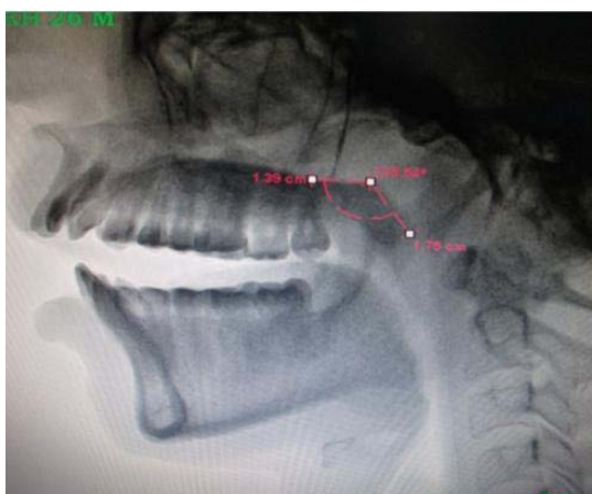
Figure 6: Angular measurements -Genu angle.

c) Maximum velar lift by estimation of distance between posterior tip of the hard palate and highest point of velar lift during phonation (Figure 3).