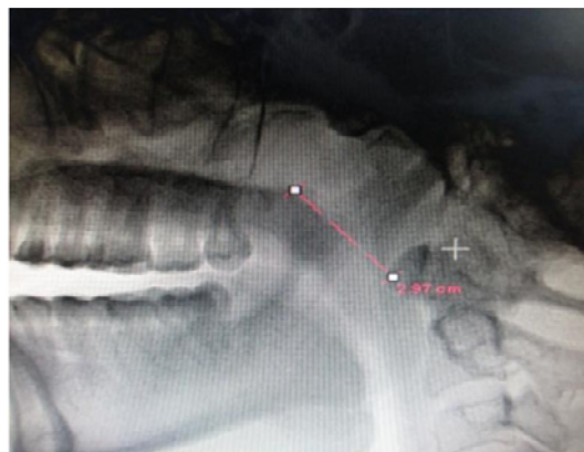
Figure 2: Linear measurements - Maximum excursion of velum during phonation towards the anterior arch of atlas during phonation.

Pre and post operative speech evaluation consisted of repeating the syllables comprising of labial stops like pa pa pa..., ba ba ba and velar stops like ka ka ka..., ga ga ga. Conversational speech samples included asking patient to speak their name, father’s name, school name, counting from sixty to seventy and counting from one to