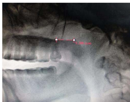
Figure 3: Linear measurements -Maximum velar lift by estimation of distance between posterior tip of the hard palate and highest point of velar lift during phonation.

ten in the regional language so as to have alternate vowel and consonant speech. From this, speech pathologist did a perceptual speech evaluation to assess hypernasality and overall speech understandability according to 4- point scale given by Henningsson et al in 2008 [7] (Table 1).