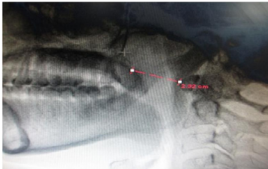
Figure 4: Linear measurements -The maximum distance of the velar midpoint, at rest from the anterior arch of the atlas.