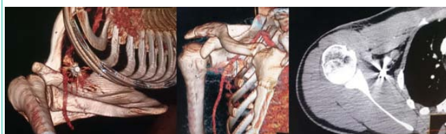
Figure 3: CT scan of the right shoulder showing the location of the foreign body.