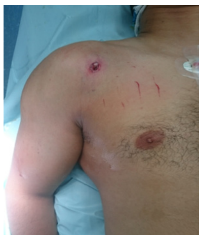
Figure 1: Clinical image showing the entry port.

The patient underwent a surgical trimming plan by plan, from the surface to the depth: the skin and the mortified subcutaneous cellulose-fatty tissue are excised to the healthy and vascularized zone