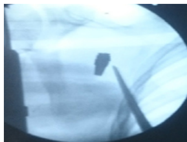
Figure 2: Right shoulder x-ray showing the location of the foreign body.