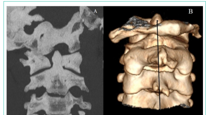
Figure 1: 23-year-old patient with irreducible torticollis following a suicide attempt by hanging. (A) Coronal reconstruction CT showed a rotatory dislocation type I with an asymmetric position of the odontoid on the lateral masses of C1. The left lateral mass appears closer to the midline than right lateral mass. In VR reconstruction (B) easy to detect lateral displacement of the spinous process of C1 on the spinal line.

Physical examination revealed a severe neck pain in all patients with irreducible torticollis and limitation of rotational movements in all directions. No neurological signs were noted. All patients underwent a cervical spine CT scan within 72 hours of the accident.