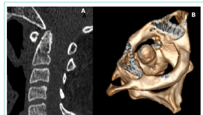
Figure 2: 19-year-old patient victim of fall in gymnastics. (A) Sagittal reconstruction CT showed atlantoaxial rotatory dislocation type IIA with anterior displacement of C1 over than 3mm. (B) A superior view in VR reconstruction confirms the rotational displacement of C1 on C2 with an eccentric position of the odontoid in the cervical canal.

CT established the diagnosis of rotatory dislocation and demonstrated rotational displacement of the C1 on the C2 axis in all patients. According to the Fielding classification [2], there was 9 cases of LRAA type 1 (Figure 1), and only one case type IIA (Figure 2). No bone fracture was detected.