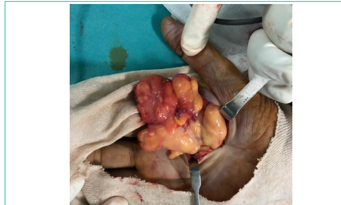
Figure 8: Macroscopic view of the giant arborescent lipoma during excision.